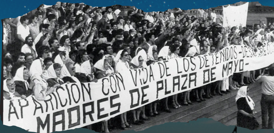
A protest in 1982 by the Madres de Plaza de Mayo, a group founded by mothers searching for children taken by the military regime.