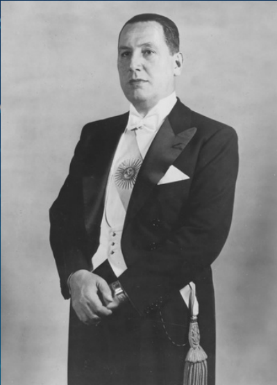
General Juan Perón (1985 - 1974)

Juan Perón was elected president of Argentina in 1946. Perón's work in industrializing Argentina, increasing economic and social benefits to the working classes and the poor brought him unwavering support from millions of laborers, known as descamisados, or 'shirtless ones.'