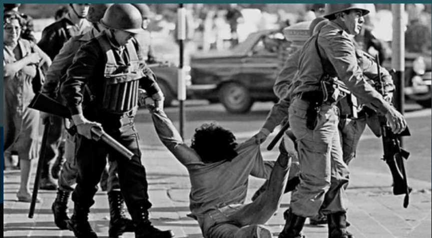
Brute force: a protester against the regime is arrested in Buenos Aires.

What happened after Juan Perón's death in 1974, led to a dictatorship known as the Dirty war where up to 30,000 were killed or made to disappear by anti-communist forces in Argentina.